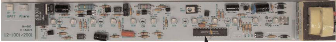
UNIT EQUIPMENT BOARD